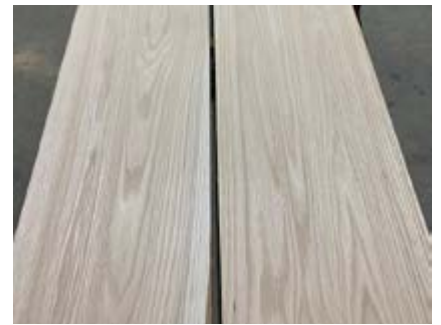
Fault docked and well graded