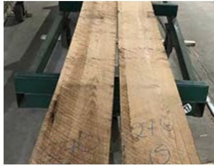
Boards with cupping and spring