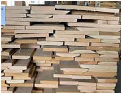
Random widths with wane, wane, cupping, end splits in very large packs