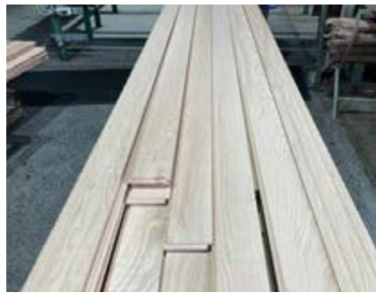
Straight line cut boards