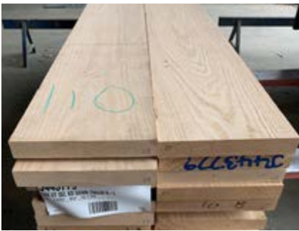
Set width with faults docked out in small packs