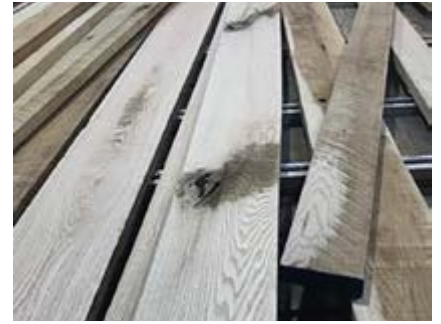
Large knots and defects mid length